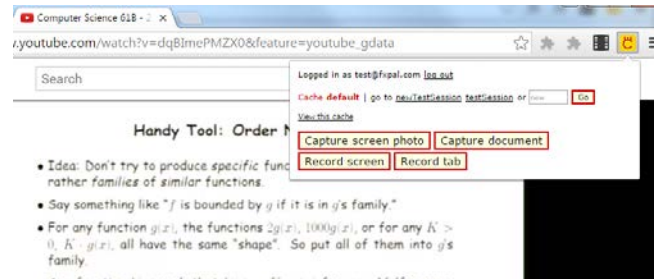
Figure 1. WorkCache includes an extension that allows users to capture multimedia screen content or documents. Screen content is uploaded to a back end server, indexed automatically, and added to a search-based user interface. Documents are sent to a separate service (see Figure 3).

http://dx.doi.org/10.1145/2964284.2973809