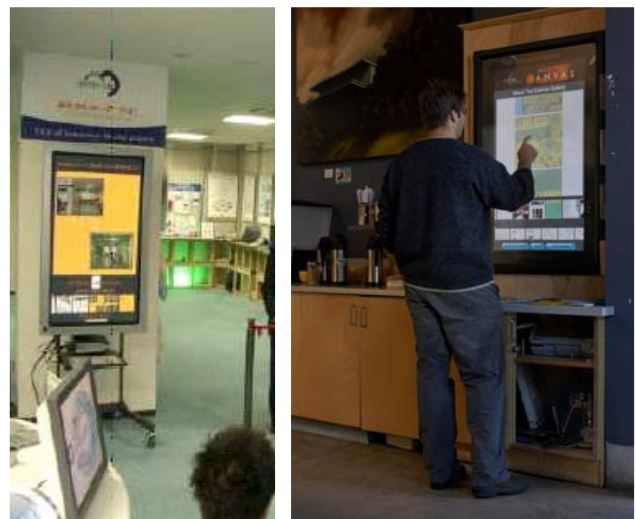
Figure 1. Plasma Posters being deployed in Japan and the U.S.

Environment dependency becomes a problem if we want to create new applications that retain some or all of the representational abilities of the older software, but have new interaction requirements (e.g., defining new ways links get followed while browsing content). This problem is especially acute in our work on the Plasma Poster Network [1]. The Plasma Posters (Figure 1) are large screen, digital, interactive poster-boards designed for informal content sharing within teams, groups, organizations and communities. Through the Plasma Posters, people encounter digital content (e.g., text, Web pages, free form scribbles, images, movies) that have been posted by other community members, and can choose to engage with that content further, or not.