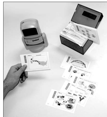
Figure 1. Palette cards are encoded with slide information permitting presentation by simply sliding a card under the Palette code reader. A presenter may compose a talk by selecting cards from one or more sets of previous talks.

The Palette thus uses physical cards to represent presentation content. Physical objects have the property that we can perceive them both focally (for periods of