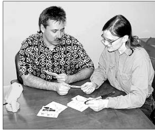
Figure 4. Co-presenters decide how to continue discussion based on questions and available material.

Performance tests conducted with our prototype support these system choices. The test configuration was a Pentium II (333 megahertz) running Windows NT 4.0 with 130 megabytes of memory and using a Symbol LS9100 barcode scanner. By adjusting barcode type and size, misreads of barcode scans were reduced to an average of 1 miss every 25 tries. We scanned sets of 100 cards manually in the same manner a presenter would use the device (with the exception of moving as fast as possible) and observed the