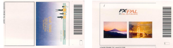
Figure 1: Palette Cards: tangible interfaces to digital materials

LEAVE BLANK THE LAST 2.5 cm (1") OF THE LEFT COLUMN ON THE FIRST PAGE FOR THE COPYRIGHT NOTICE.